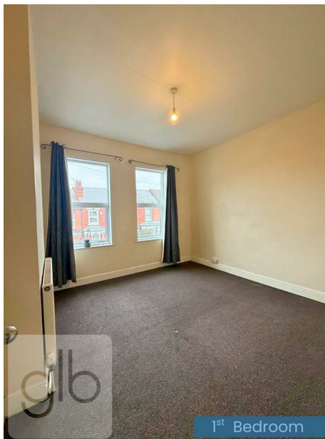
1 st Bedroom